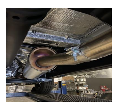
2. To remove the stock exhaust loosen the clamp from the back of the resonator. Then remove the spare tire and heat shield to aid in removal. Disengage the welded hanger using WD-40 from the OEM rubber grommets. Do not damage or remove the rubber grommets as you will reuse it to mount your new system.

1. Disconnect the negative battery cable before removal of OEM exhaust. This will allow the computer to reset and recognize the new exhaust. Lay out the exhaust on the floor so it looks like the drawing and compare parts with manual.