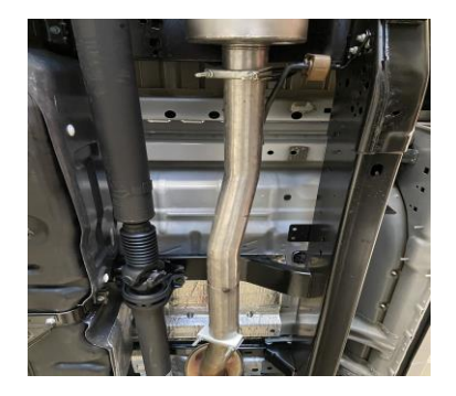
3. Install Head Pipe pipe #A onto your existing stock pipe coming out of the Resonator and attach with clamp # C. Keep the clamp a little loose.