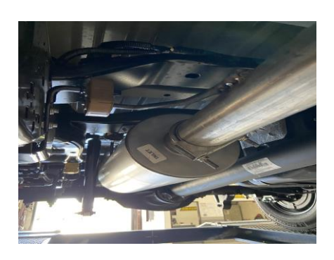
4. Install the Muffler #D onto the new Head Pipe using clamp #C. Leave clamps loose enough to have a little play.