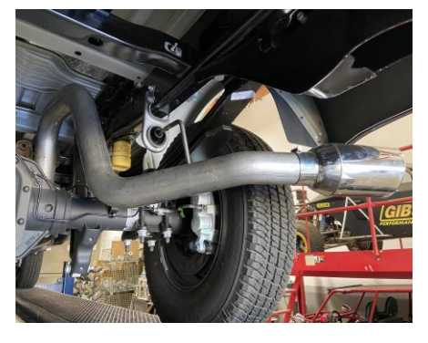
5. Now you may install the Over Axle Pipe #B into the muffler using Clamp #C. Then install the Tip onto the over axle to your desired location and tighten all clamps working front to back.